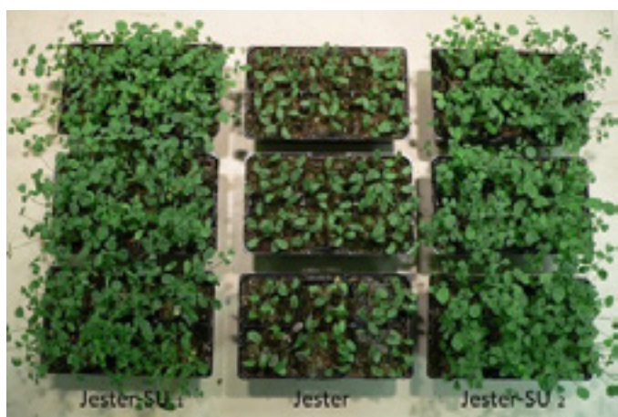
Left and right – Jester-SU superior growth compared with Jester (middle) when grown out in soils with SU residue.

Initially defer grazing at the break of the season to maximise plant establishment. Then apply grazing pressure to control upright grasses and encourage prostrate growth until ground cover is complete. Increase grazing pressure if necessary to prevent overly bulky pastures which are more susceptible to moisture stress and foliar fungal disease. Ensure a good seed-set at least one year in four to maintain adequate seed-soil reserves for maximum persistence, regeneration and production.