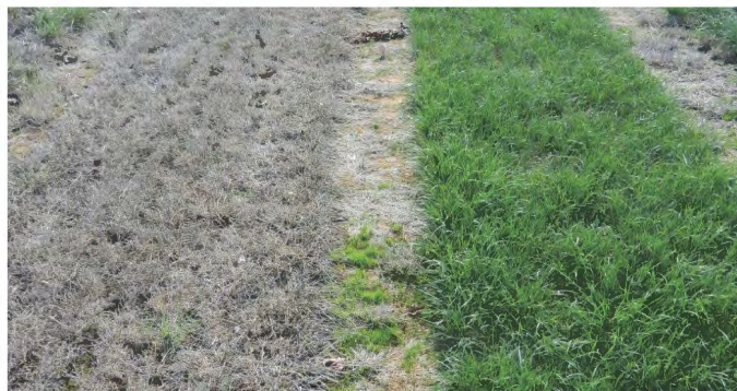
Summer active fescue

Post summer recovery - year two, Howlong NSW