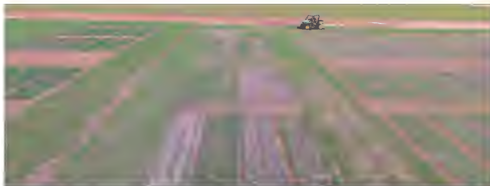
Image 1: Front Row L-R (Breeders Line, Summadorm, Uplands, Kasbah) in Summer dormant cocksfoot trial - Howlong 2016-2018

Winter and total yield (kg DM/ha) of Siesta and Uplands cocksfoot at Howlong 2016–2018. Note: Trial was terminated in year 3 due to poor persistence of Uplands/Breeding line.